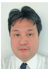
Photo of the participant in SMEDO