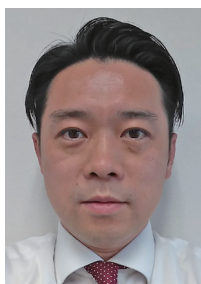
Photo of the participant in SMEDO