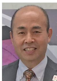
Photo of the participant in SMEDO