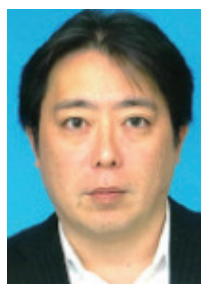
Photo of the participant in SMEDO