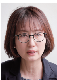
Photo of the participant in SMEDO